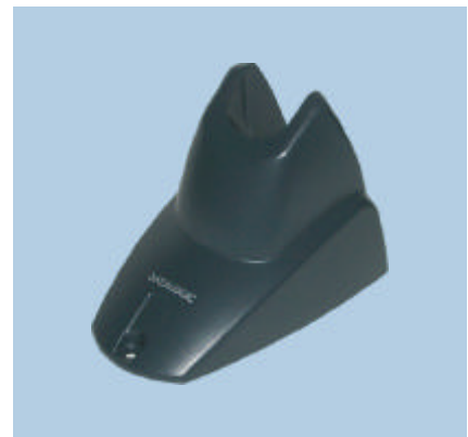
STD Heron™ Hands-Free Stand with optional metal plate