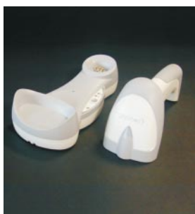
Clockwise from left: Gryphon Stand, Desk holder, Wall holder