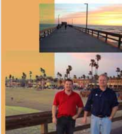
RecFind 6 Training Los Angeles, California

Enthusiasm for RecFind 6 has been high with students looking forward to getting their hands on the product when they return to work. The end users seem to like the new OCR/PDF functions when scanning documents as well as being able to scan from within the RecFind 6 Button application. They also like the new icons and interface, especially the ability to customize the colors and fonts.