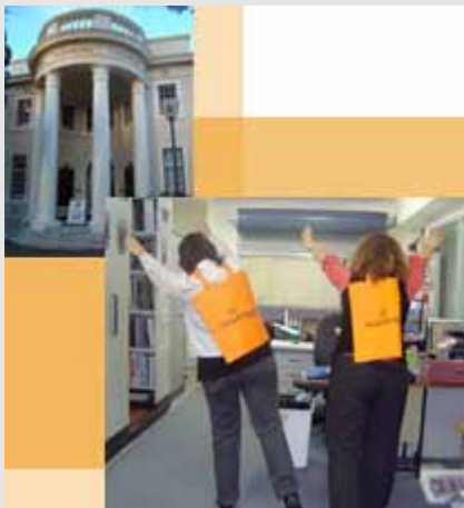
RecFind 6 Training Gannawarra Shire Council, Australia